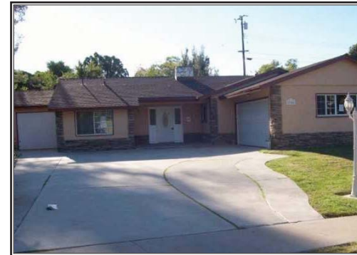
2949 Sequoia Ave, Fullerton This custom built ranch home is perched high away from the street. Lots of curb appeal! Double door formal entry, formal living room and dining room with romantic fireplace, open kitchen with granite counters, huge master suite with walk in closet, family room with French doors, recessed lighting and smooth ceilings. $599,000