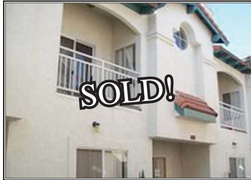
229 N Coffman St, Anaheim Very nice newer Anaheim condo! Priced $50,000 below comps for quick sale! No one above or below! Two story, three spacious bedrooms, two and a half baths, 'wood' laminate flooring, romantic fireplace, cathedral ceilings, lots of natural light, laundry area in the two car garage, beautiful grounds. $199,900