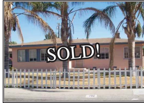
702 N Hawthorne St, Anaheim Terrific bargain on a home with tons of potential! Large corner lot, tons of curb appeal, custom tile floors, extravagant romantic fireplace, sunny breakfast room and remodeled kitchen, large bedrooms, hardwood floors, inside laundry, crown moulding, central air and heat! $340,000