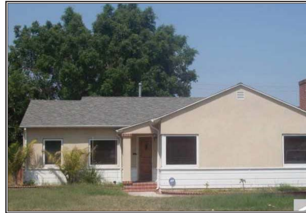
705 N. Harbor Blvd

There are 96 homes for sale. The average home in the 92805 zip code that is available for sale is three bedroom, 1281 square feet, asking $289,193 and has been on the market an average of 96 days. The average home in “pending” status is a three bedroom, 1434 square feet, asking $316,620, averaging 52 days on the market.