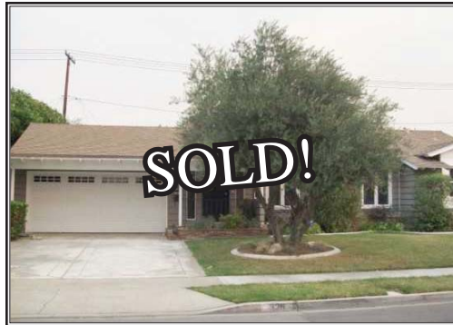
326 S Ramm Dr, Anaheim Absolutely gorgeous ranch style home on superb street! This home has tremendous curb appeal and adorable front porch. The interior offers hardwood floors, smooth ceilings, recessed lighting. This home offers two gorgeous fireplaces, a formal living/dining room and HUGE family room with cathedral ceilings. $389,900