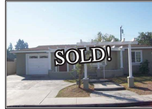
218 W Tiller Ave, Anaheim Fantastic buy on single story home with lots of curb appeal! Centrally located near freeways, shopping, schools and more! This home offers a large front porch, living room, dining room and bright kitchen. There is a one car attached garage and TONS of parking. $272,900