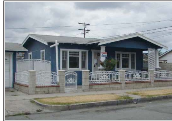
214 E. Valencia Ave