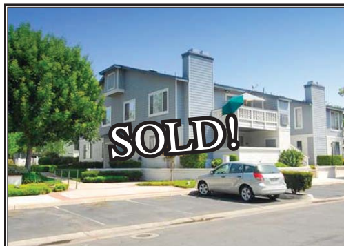
12061 Brighton Riv 51, Fountain Valley Escape into this pride of ownership gated community in lovely Fountain Valley! This lovely upstairs two bedroom home features vaulted ceilings, a private patio, romantic fireplace and private laundry room with in the home. $249,900