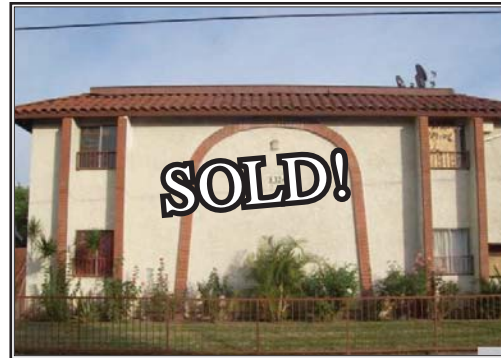
1324 Peckham St D, Fullerton You Can own this upper end unit condo in a centrally located area of Fullerton! You can own for the cost of rent! Open floor plan with ceramic tile flooring, large living room and formal dining area. Great sized bedrooms, large private balcony and gated parking. $114,900