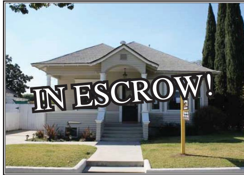
221 N Resh, Anaheim

Gorgeous transitional style home in Anaheim Colony Historic District! This home is under the Mills Act contract with the City of Anaheim which means that if you keep it beautiful on the outside and from the front and doesn't change any historic facade features you get up to 60% off of your property taxes!