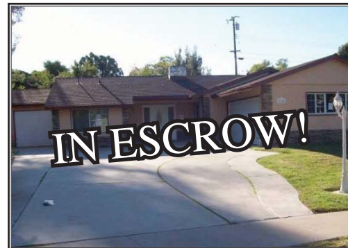
2949 Sequoia Ave, Fullerton

This custom built ranch home is perched high away from the street. Lots of curb appeal! Double door formal entry, formal living room and dining room with romantic fireplace, open kitchen with granite counters, huge master suite with walk in closet, family room with French doors, recessed lighting and smooth ceilings.