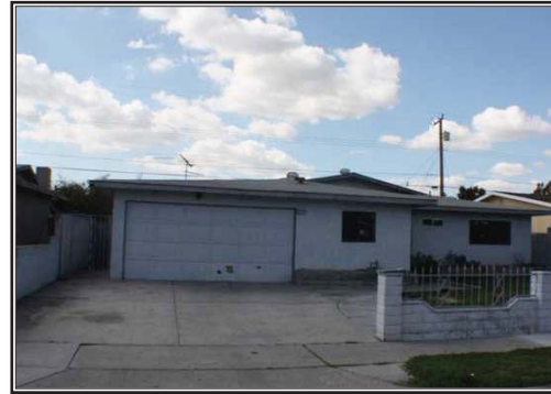
715 N Rose St, Anaheim

Super bargain in Downtown Anaheim! Close to 5, 55, 91 and 57 freeways! Weekly farmers market, shopping and schools nearby! Extra large home (LARGER THEN TAX ROLL), five bedrooms, three baths, large kitchen, large eating area, formal dining room, formal living room, central air and heat.