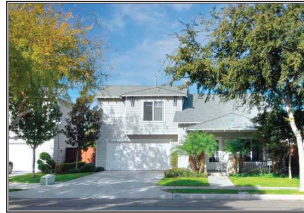
585 E. Cypress St