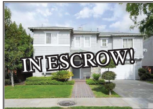
575 E Cypress St, Anaheim

What an opportunity! NOT a short sale or a REO sale! This beautiful home is just over 10 years old, built by Kaufman and Broad in the Legacy Tract of pride of ownership homes and located in Downtown Anaheim (which is Anaheim Colony Historic District) which is close to everything!