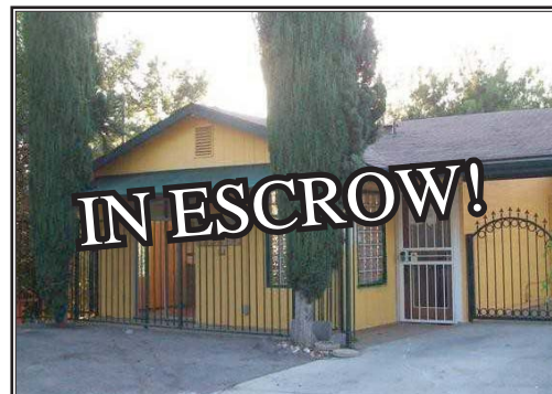
986 Montecito Dr, Los Angeles

Built high upon the hill, with mature trees, wildlife and unobstructed views of Downtown Los Angeles, Mt. Washington and gorgeous sunsets! This home was built to enjoy this view!