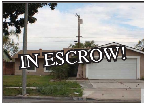
1259 E Bassett Way, Anaheim

Absolutely adorable four bedroom two full bath home on pride of ownership street! Close to everything! Freeways, schools, shopping and tons of entertainment! This home features large front driveway with access to two car attached garage, adorable front porch, remodeled large, bright and very open kitchen.