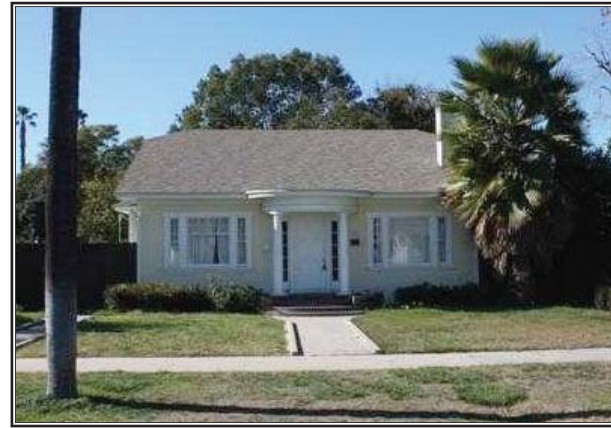
615 N. Lemon

There are 93 homes for sale. The average home in the 92805 zip code that is available for sale is three bedroom, 1300 square feet, asking $304,872 and has been on the market an average of 108 days. The average home in “pending” status is a three bedroom, 1340 square feet, asking $286,376, averaging 62 days on the market.