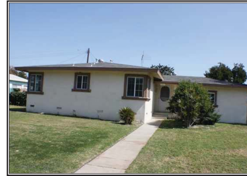
12322 Tamerlane Dr, Garden Grove

Brand new listing! Adorable home on HUGE corner lot in the beautiful city of Garden Grove! Just south of the resort district which offers shopping, dining and entertainment, minutes from the 22, 91, 57, 5 freeways!